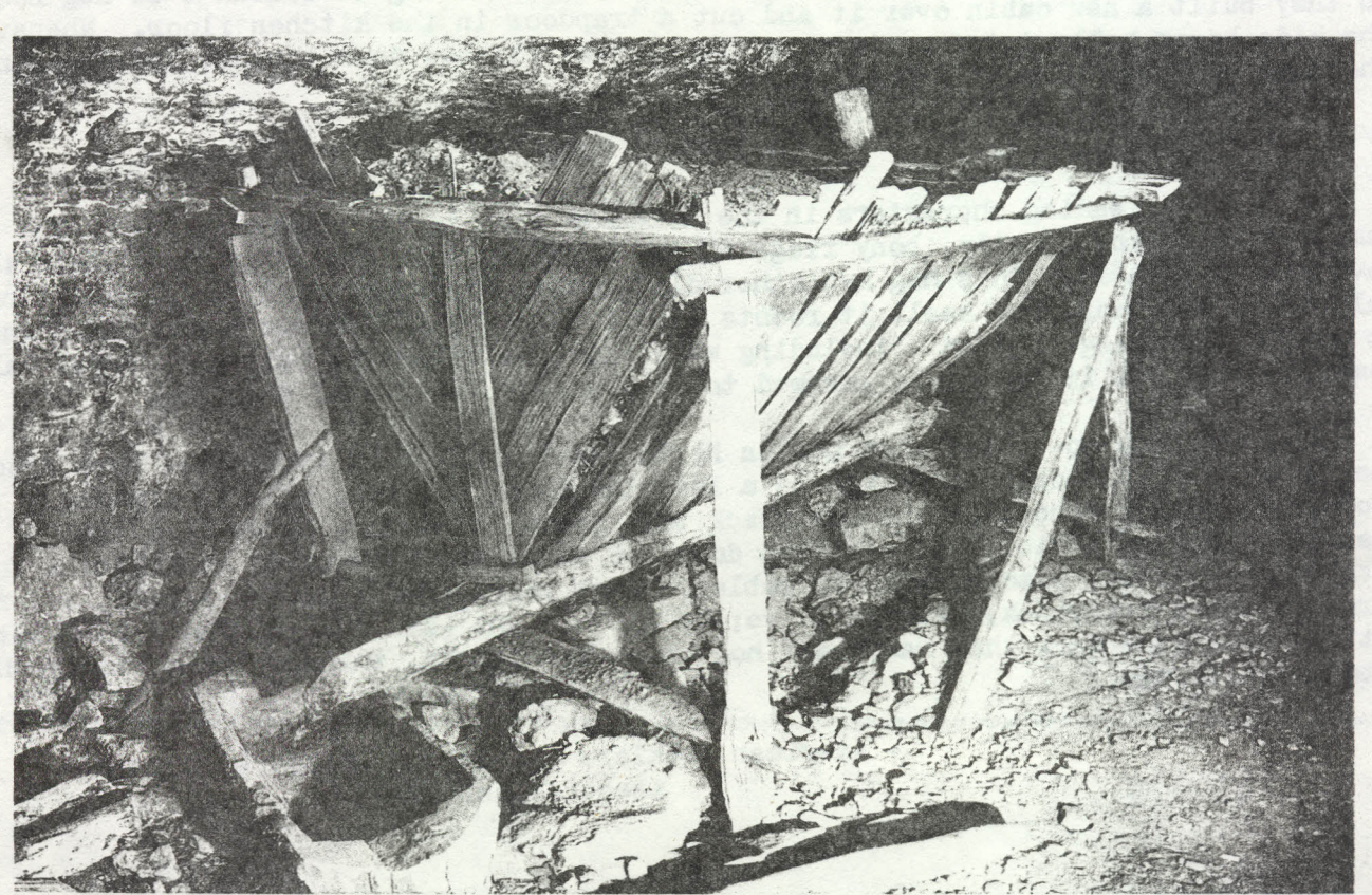
View of one of the 37 wood hoppers used in making gunpowder in Organ Cave.